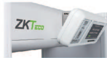
◀ Metal bracket