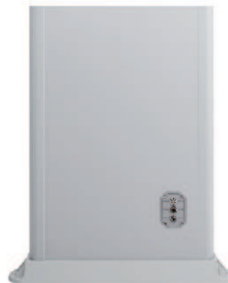
◀ Power supply and linkage interface