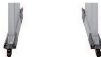
◀ Universal wheel